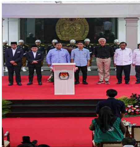
Figure 1. Candidate of President 2024

The presidential election is getting closer and voters continue to observe and process data, so that it can be used as a consideration and basis for choosing. Meanwhile, the process closest to voter behavior is the campaign before the election and events reported by the mass media (Pasaribu. et al, 2022). Each element in this process will influence voter behavior, although the focus of the Michigan Group study is party identification and developing political issues and candidates, and not their social or cultural background.