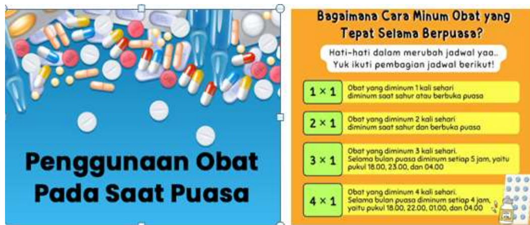
Picture 1. Poster Use of Medicine During Fasting

meal, it means approximately 30 minutes before suhoor or dinner/large meal. After a meal, it implies when the stomach is filled with food, approximately 5-10 minutes after a large meal. If there is medication that needs to be taken in the middle of the night after eating before taking the medication, the stomach can be filled first with biscuits.