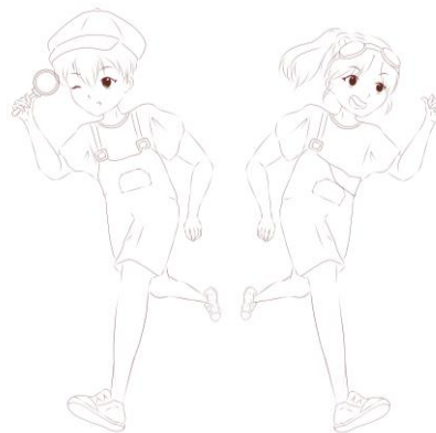
Figure 3. Mascot Sketch

Then, the initial sketches are made, encompassing various poses, expressions, and visual details that will help visualize how the mascots will look and interact with the audience. This process allows the designer to explore various alternatives and ensure that the final mascot design will effectively convey the messages and values that Zabava Labs wants to communicate.