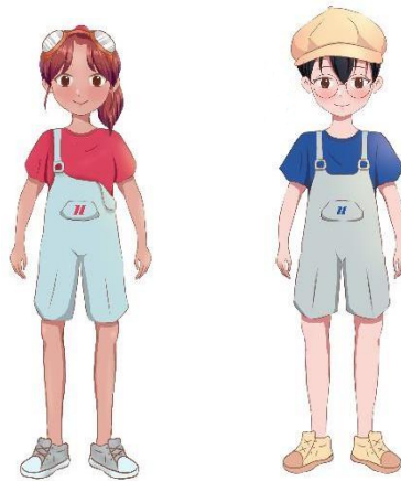
Figure 4. Images of the Prototype Results