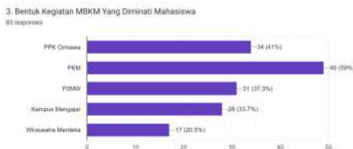
Figure 3. Types of MBKM activities that students are interested in

Based on Figure 2, 0 students were not interested in MBKM, 27 (32.5%) students were normal in responding to MBKM, and 58 (69.9%) students were very interested in the MBKM program organized by the Ministry of Education and Culture.