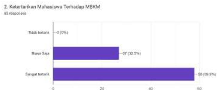
Figure 2. Student interest questionnaire towards MBKM Program

Bachelor of Nursing students' interest in the MBKM program is very enthusiastic, interest is the first step in student participation in implementing the MBKM program. The existence of the MBKM policy that has been issued by the government through Minister of Education and Culture Regulation Number 3 of 2020 concerning National Higher Education Standards is not something completely new. Students' experience in carrying out activities similar to MBKM increases the level of interest of most Bachelor of Nursing students in the English learning process.