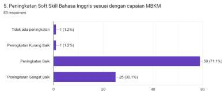
Figure 5. Questionnaire results for improving English soft skills in accordance with MBKM achievements

Based on Figure 4, the benefits felt by students receiving the MBKM program with 83 respondents (100%) agreeing that students gain additional competencies.