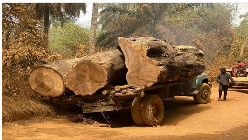
Figure 5 - Logging activities in Idanre

Business owners described business activities as slow due to poor tourist inflow; stating a lot of their colleagues are now out of business as they decried the poor state of tourism in the area. They expect better from the government, some business owners say unsteady electricity has been a source of concern and a threat to their businesses. They claim they make more sales during festive periods but, since festivals haven't been taken place.