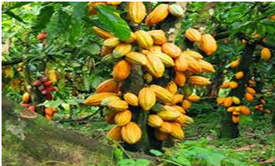
Figure 7. A Picture Showing Agricultural Activities Cocoa Farming in Idanre Hills.