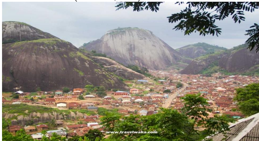
Figure 8: Views of Idanre town and hills.

The main attractions are derived from engagement with certain features of the locality of Idanre itself such as the agbagba hill, carter hill, ilesun hill, arun river, thunder water, the ancient primary school, tourist chalets, ancient buildings, the ancient palace, the mausoleum, ancient court and prison. This is in addition to other features namely the religious festivals such as the Mare festival, the Use festival, and the Orosun festival. (Olu et al., 2018).