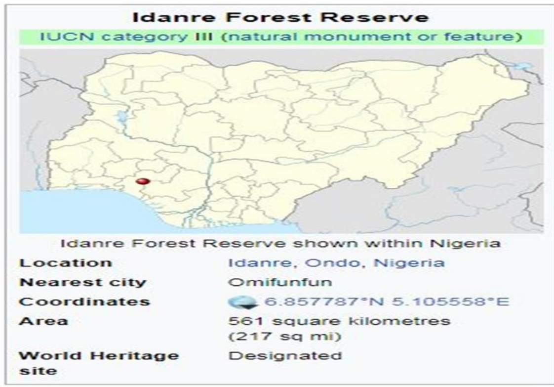
Figure 4: Location Map of Idanre Forest Reserves.

timbering activities taking place in most parts of the forest under government licensing and there is no full conservation of forest in Idanre.