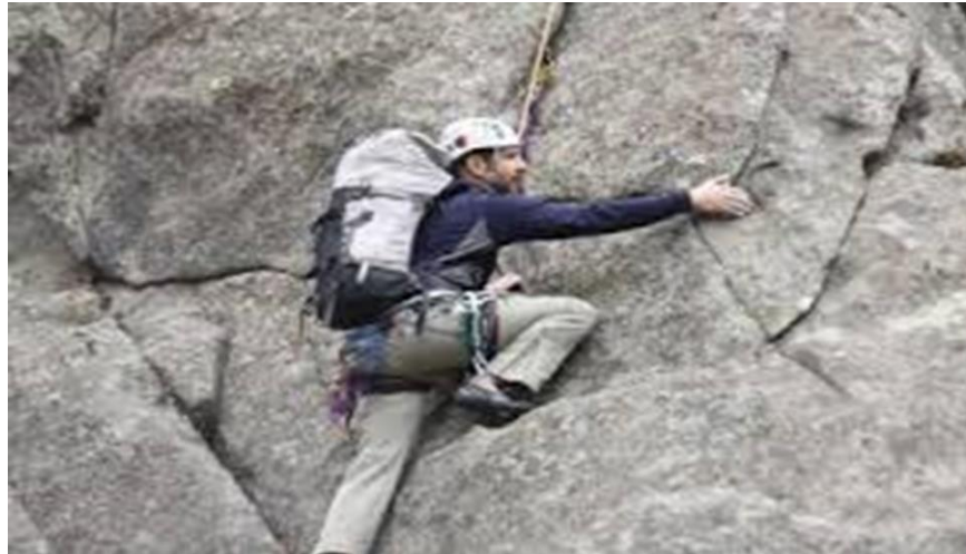
Figure 9. A Climber during Mare Festival