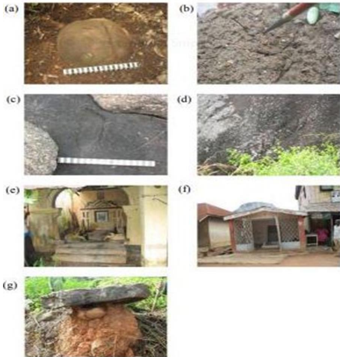
Figure 2. Pictures showing some artifacts in Idanre hills.