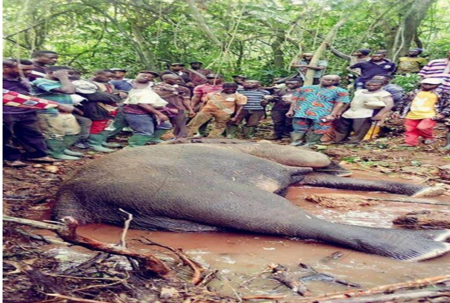
Figure 6 - A picture showing poaching in Idanre. An elephant was killed in Idanre.