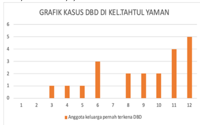
Figure 1. Discovery of Dengue Hemorrhagic Fever Cases with Data Collection In 12 Rts In Tahtul Yaman Village

Based on the Dengue Fever Case Graph in Tahtul Yaman Village above, it can be seen that family members who have been affected by dengue fever cases are as follows: RT 03 has 1 case, RT 04 has 1 case, RT 05 has 1 case, RT 06 has 3 cases, RT 08 has 2 cases, RT 09 has 2 cases, RT 10 has 2 cases, RT 11 has 4 cases and RT 12 has 5 cases, and RT 1,2,7 have no cases.